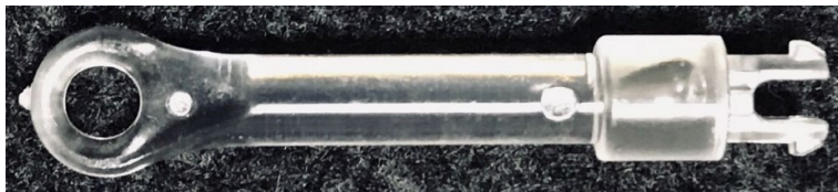
Tilter stem (inside hardware box or taped to headrail)

On the 2 1/2" blinds, the tilter mechanism comes partially disassembled. You will have to plug the stem into the mechanism like so: